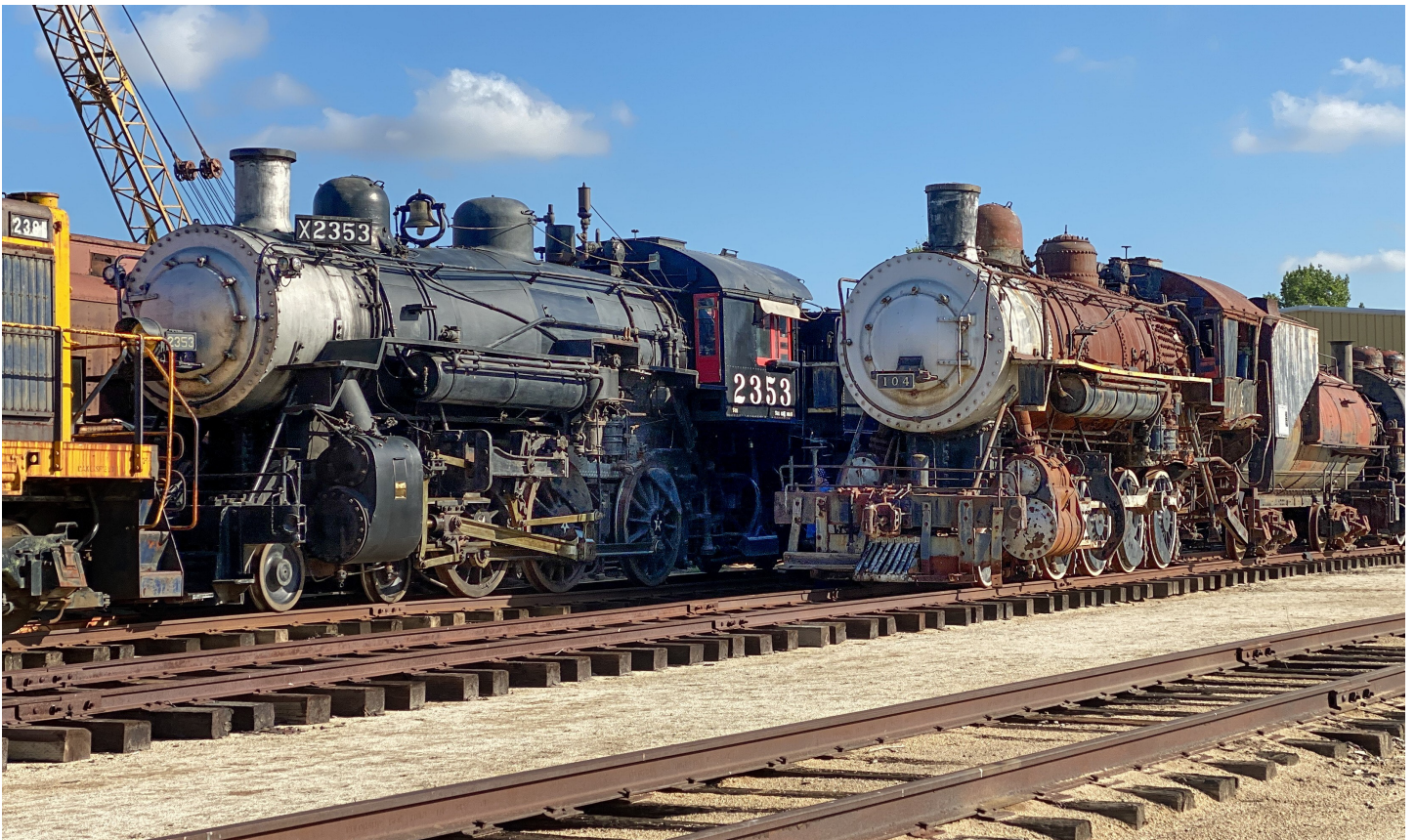
Steam locomotives SP 2353 ( https://www.psrn.org/trains/steam/southern-pacific-2353/ ) and SD&A 104 ( https://www.psrn.org/trains/steam/sda-104/ ) are two of our most treasured artifacts at our Campo museum site. Both worked on the SD&AE thru Campo, one pulling passenger trains, the other freight trains.