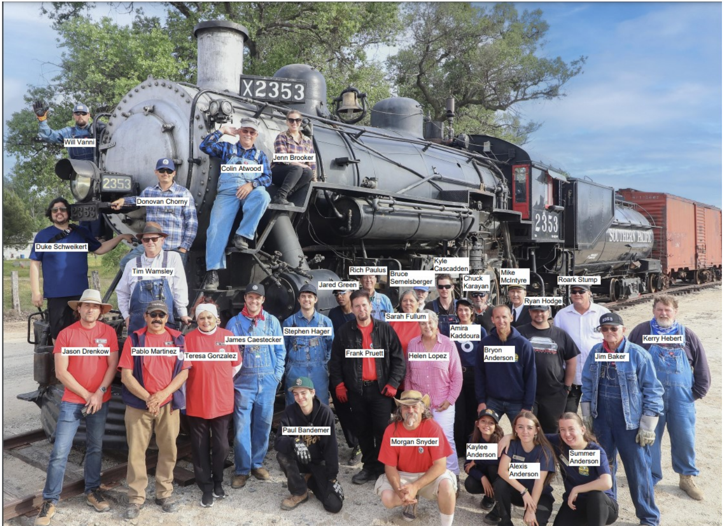
A group photo was taken at the end of Campo Days. Included were all the volunteers that could get away late on the Saturday afternoon. Photo by Jason Drenkow 5/4/24